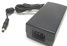
Desktop Adapter 48W (12V 4A)