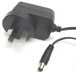
Mini Adapter 24W (24V 1A)

Matchbox size wall plug adapter. Models for other countries available.