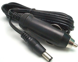
Car Adapter Car cigarette lighter adapter

Matchbox size wall plug adapter. Models for other countries available.